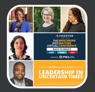
<u>Leadership in Uncertain Times /</u> <u>Radical Self Care</u>