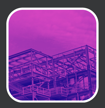
"Don't Rebuild, Upbuild! --Reimagining Nonprofit Infrastructure"