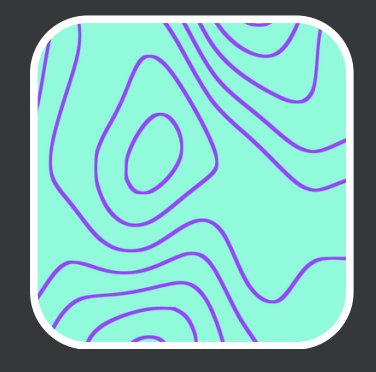
Leadership Carepacity: Disrupting the Nonprofit Burnout Cycle