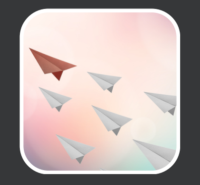
<u>SIPS & Leadership with Surabhi Lal</u> Unique Brathwaite