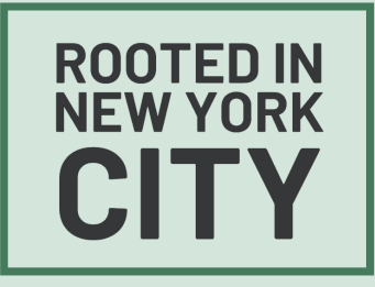
Since 1979, we have strengthened & supported thousands of NYC-based organizations, City agencies, and philanthropic organizations.

100% of our senior management team is comprised of BIPOC leaders.