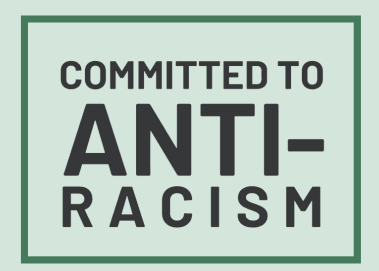
We incorporate a racial equity lens in all of our work — from the inside all the way out.